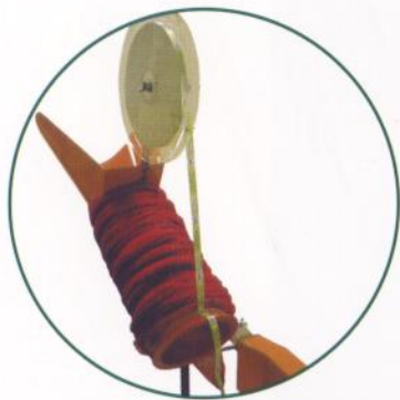
headstock + Bolduc dispenser

The GH-20 is extremely easy to use. The product to be packed is loaded into the tube, around which net has been loaded. One easy action cuts, clips the pack being made and the bottom of the net on the tube ready to start the next packing cycle.