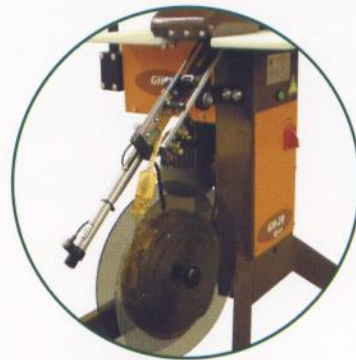
headstock + Wineglass dispenser

The GH-20 can be fitted with several accessories including Wineglass label dispensers. Bar codes, price, and other variable information can be applied to the pack with a Wineglass shaped label, automatically dispensed during the packing cycle. The labels are printed using the Printcod thermal printing unit.